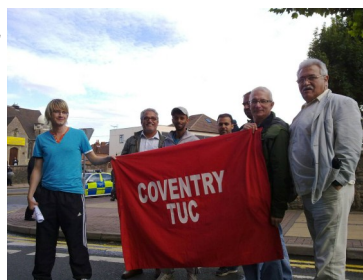
Coventry activists against EDL

threatened and attacked other minority groups –