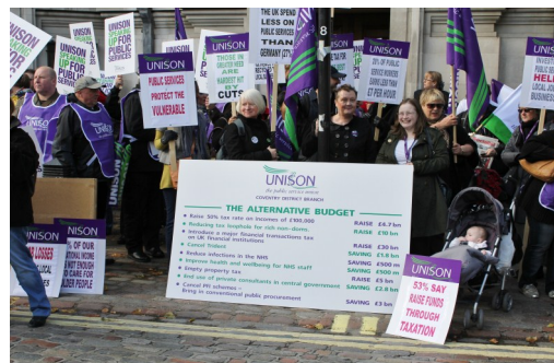
Coventry Unison Members Lobby Parliament—October 19th - Pic—Dawn Palmer -Ward

Tens of thousands have already protested and lobbied across the country. Unison will unite with our sister unions in the City Council and with the city wide anti-cuts campaign to defend public services in our city and across the UK.